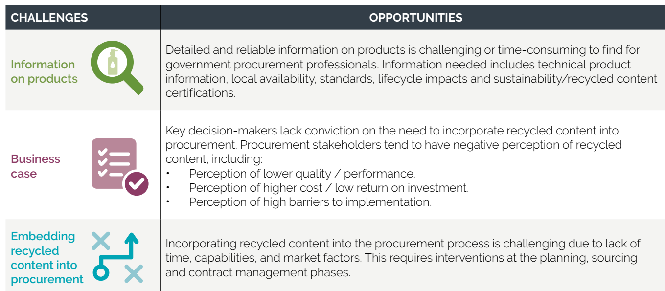
Table 5 – Summary of Challenges

presented in Tables 1-4, consideration of APCO's role, support capacity and feedback received during a workshop with government stakeholders.