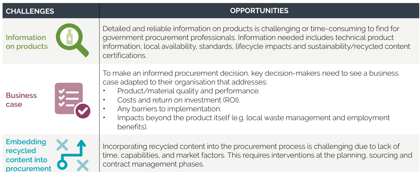
Table A – Summary of challenges and opportunities

ISO 20400: 2017 – Sustainable Procurement - Guidance. Three opportunities were identified where APCO had sufficient influence to help overcome these challenges. These opportunities are summarised in Table A below.