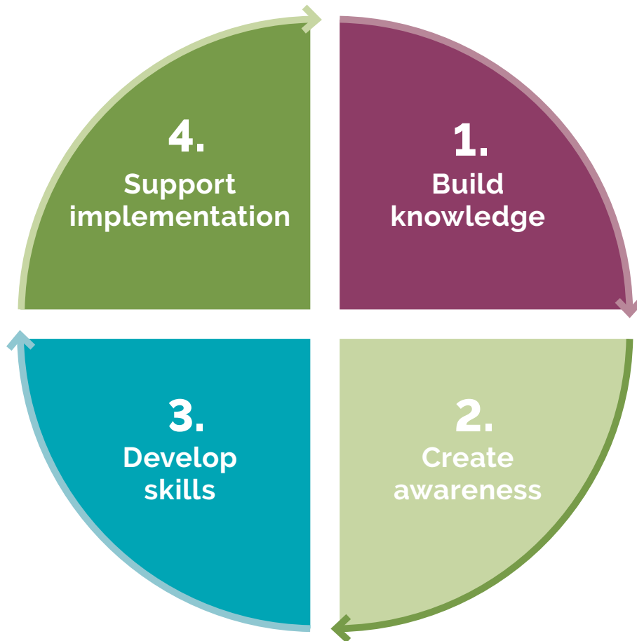
Figure A: Recycled content procurement support strategy

Based on the analysis of challenges and existing solutions, four strategies to support governments were identified. These are summarised in Figure A and Table B below.